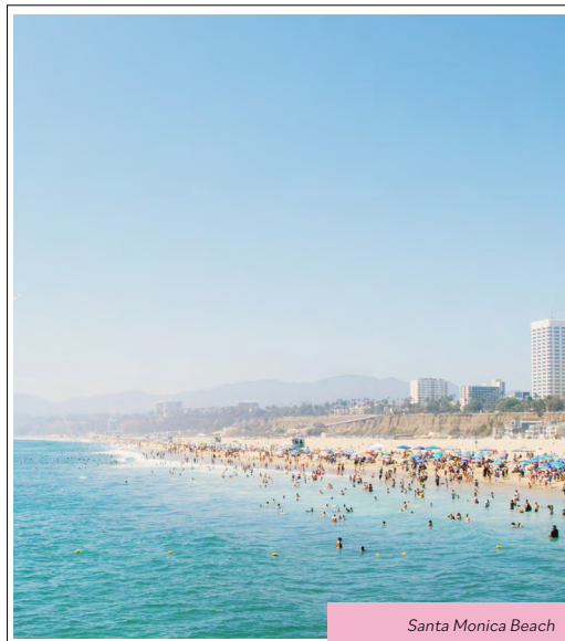
Santa Monica Beach

Residences: Single gender, 2-bedroom apartments with semiprivate bathrooms and living room.