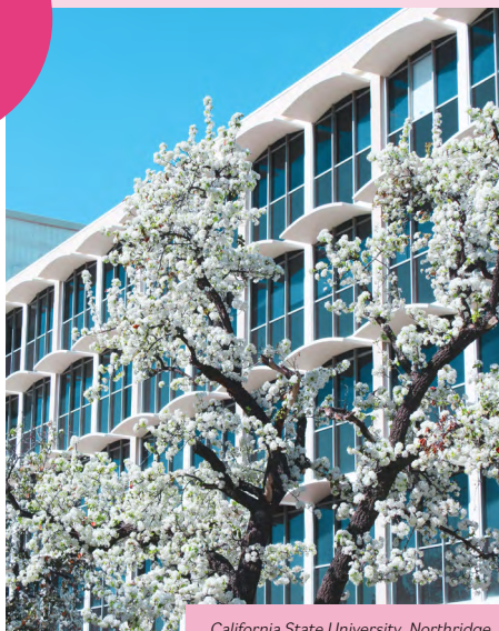
California State University, Northridge